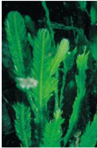
Caulerpa ( Caulerpa taxifolia )